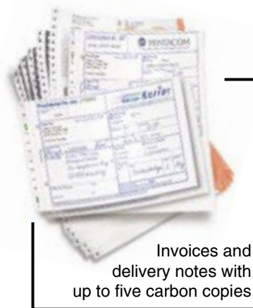
Invoices and delivery notes with up to five carbon copies

The extra-fast 24-dot letter-quality printer