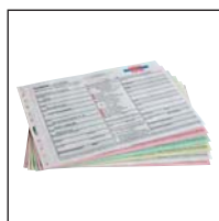
Up to 8 duplicates